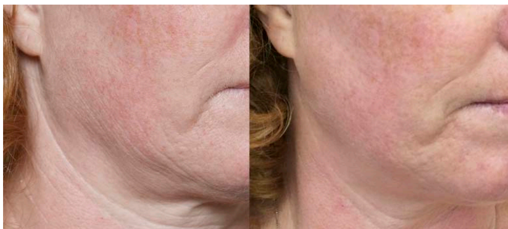
Figure 3. Before and after of lift in the cheek area.