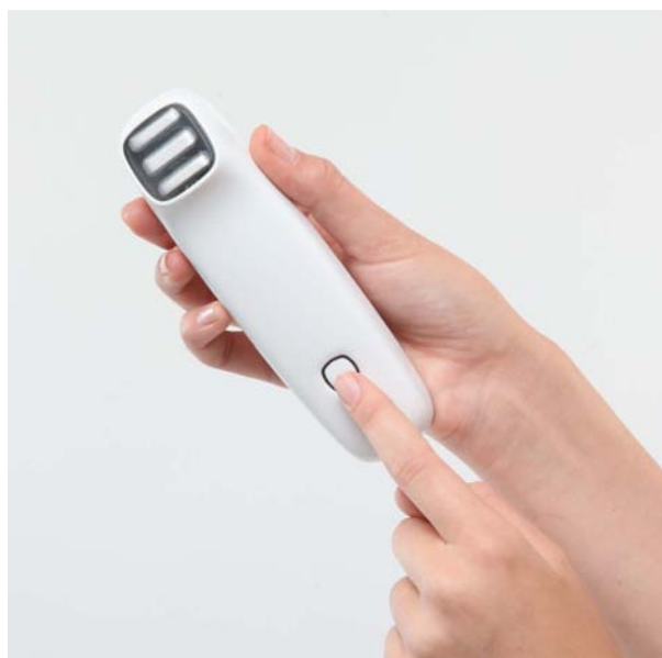
Figure 1. The HST home-device.

mal end point for prolonged periods of time, minimizing “hot spots” and patient discomfort, optimizing dermal matrix response, wrinkle reduction, and laxity improvement. There are 5 power levels that are chosen by the operator according to comfort. Levels 3 - 5 are emitting 5 watts, 10 watts, and 15 watts RF, respectively. In addition there is heating via a red spectrum LED. When the epidermal temperature reaches the end point temperature (41°C - 43°C in levels 3 -5, respectively), the device senses this temperature and the RF energy is inactivated. Once the temperature falls below the end point temperature, the RF is turned back on again. This cycle will continue as long as the operator wishes to maintain this soft tissue thermal end point. Thus, temperature end point is achieved quickly, well controlled and safely sustained. Additional safety features include the ability of the impedance sensors to detect when the dermal temperature is rising too quickly and the dermal impedance drops suddenly, resulting in the RF energy to be shut-off automatically. Conversely, if the electrodes stray off the skin, the impedance rises too high and the RF is shut-off (limiting RF arcing or poor contact discomfort).